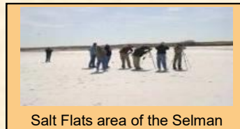
Salt Flats area of the Selman

This trek includes bus transportation , a box lunch & snacks.